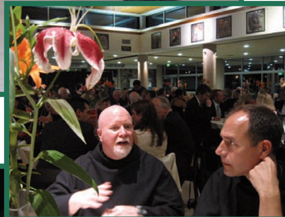
Photos from top down: African dancers greet Gala guests at the US Bank Gathering Space at the Milwaukee County Zoo.